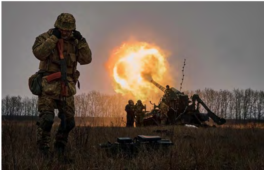
FILE - Ukrainian soldiers fire a Pion artillery system at Russian positions near Bakhmut, Donetsk region, Ukraine, Friday, Dec. 16, 2022.

The Russian Ministry of Defense (MoD) - and a Ukrainian official cited by The New York Times - claimed the drones were used in December attacks on the Engels and Dyagilevo air bases that reportedly damaged some Russian aircraft and injured personnel.