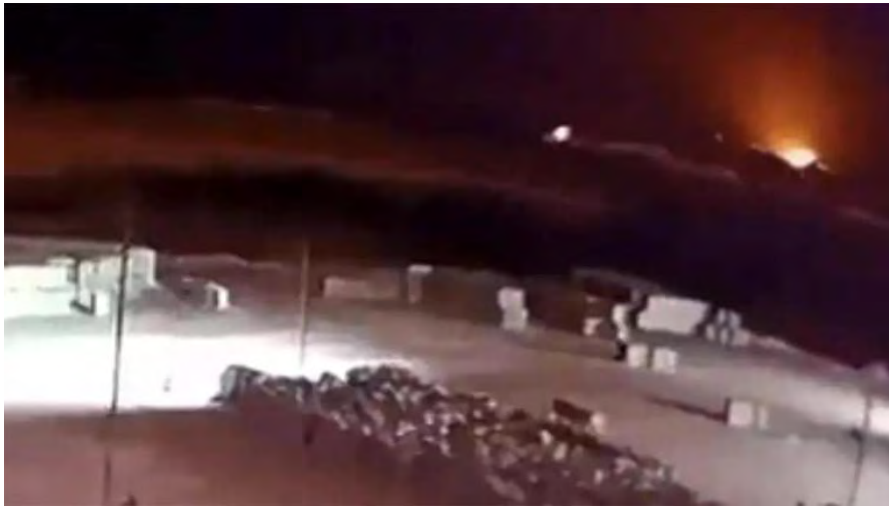
Ukraine Situation Report: Possible Tu-141 Strike Deep In Russia Shows Repurposed Warhead

Ukrainian officials have promised not to use weapons supplied by the west to attack inside Russian borders. But they've never made any such assertions about their own weapons, one of which apparently exploded Monday near the city of Kaluga some 200 miles northeast of the border and 100 miles southwest of Moscow.