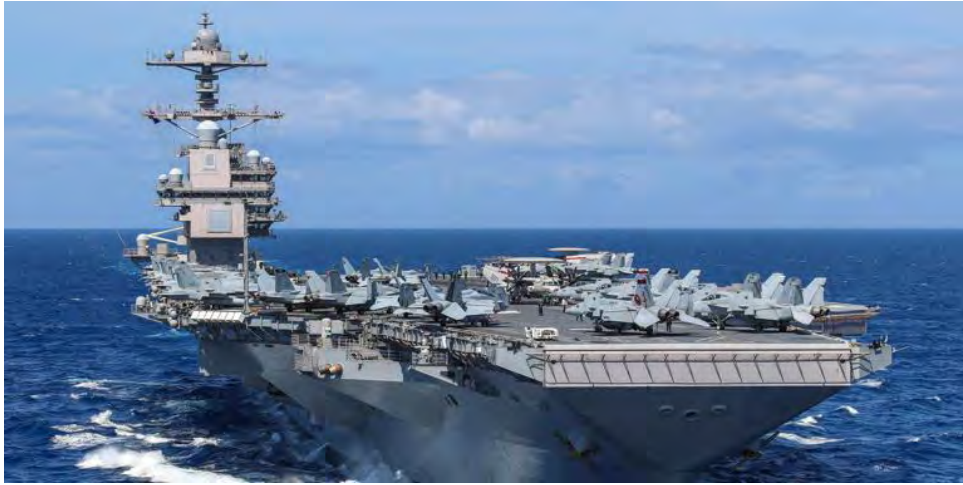
The USS Gerald R. Ford set sail on October 4, 2022, from Norfolk, Virginia.