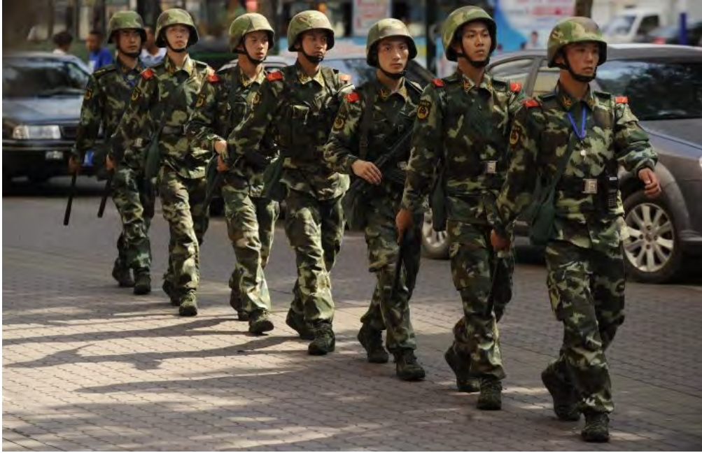
Chinese paramilitary police patrol on a street in Urumqi, capital of China's Xinjiang region

WASHINGTON (Reuters) – China has possibly committed "genocide" in its treatment of Uighurs and other minority Muslims in its western region of Xinjiang, a bipartisan commission of the U.S. Congress said in a report released on Thursday.