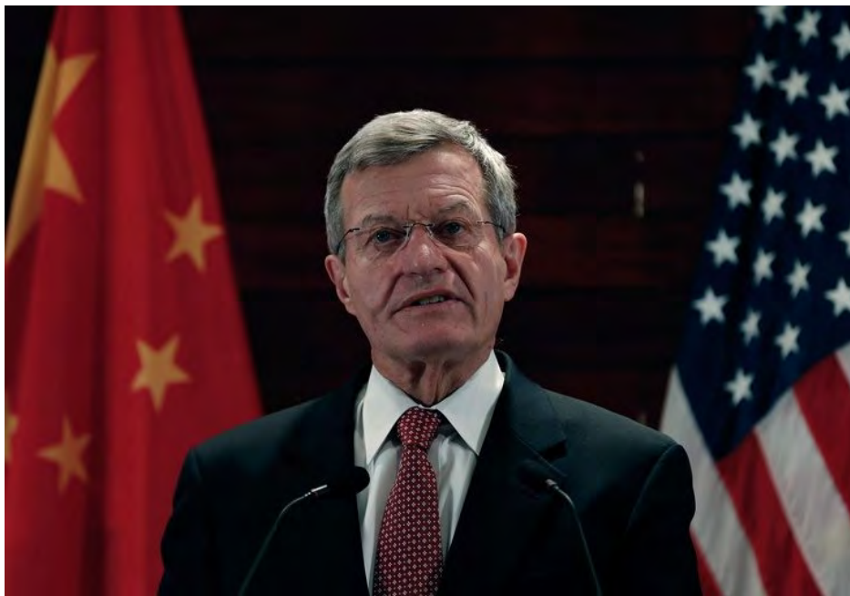
Former U.S. ambassador to China Max Baucus

Former ambassador Baucus appears regularly on Chinese propaganda outlets