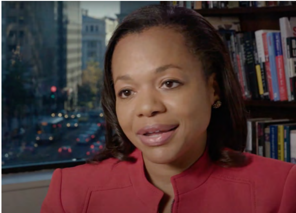
Kristen Clarke

Kristen Clarke, President-elect Joe Biden's pick to lead the Justice Department's Civil Rights Division, advanced pseudoscientific theories of black racial superiority and organized an event with a notorious anti-Semite as a student at Harvard University.