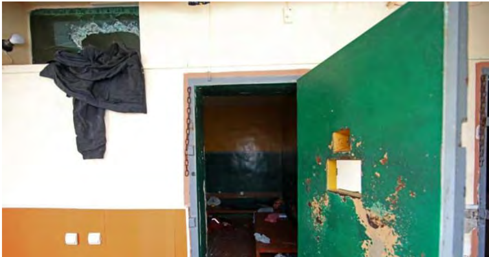
A Russian torture chamber in Ukraine.