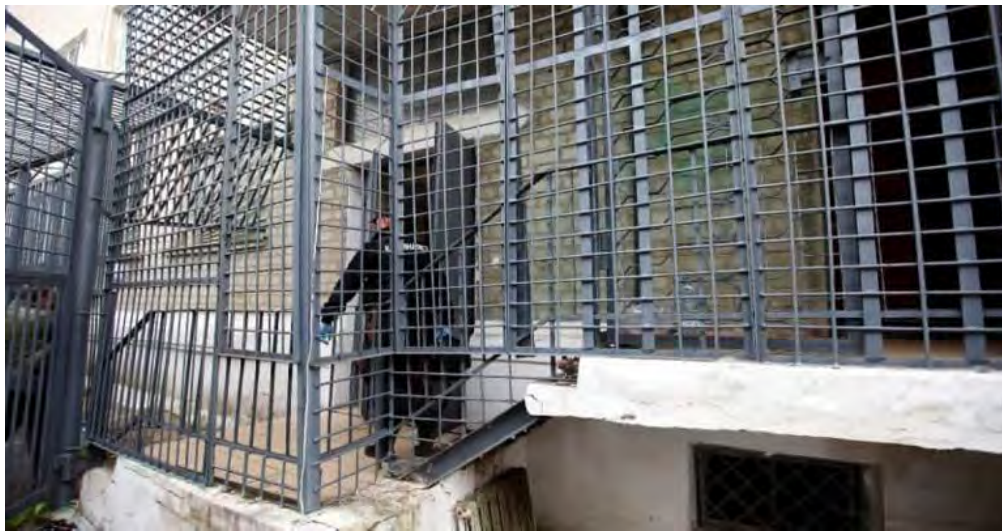
Inside Vladimir Putin's Terrifying Electrocution Torture Chambers Human Rights Watchdog Fears Are Just 'Tip of Iceberg'

Human rights activists have uncovered horror stories of torture and abuse perpetrated at a number of Russian President Vladimir Putin's secret chambers in Kherson, Ukraine.