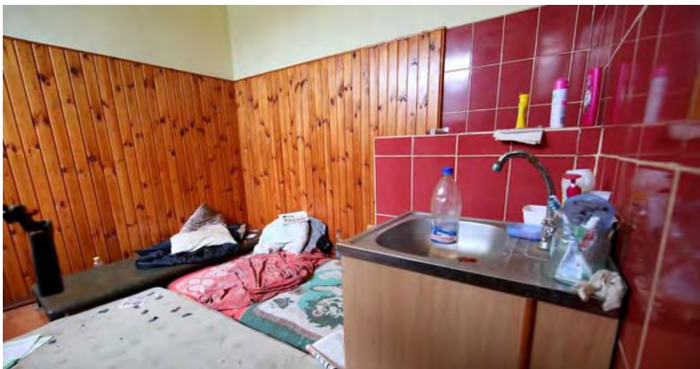
A Russian torture chamber in Ukraine.

The city, which was recaptured by Ukrainian forces from Russian invaders in November 2022, has now become a shocking testament to the brutality of the atrocities that were committed.