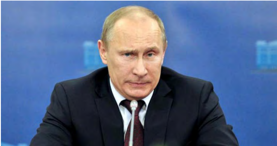
Vladimir Putin

The team is investigating two main things, the “abduction of children and the destruction of civilian infrastructure.” Jordash added that Russia had been deploying tactics to instill Russian values in local populations in order to establish control.