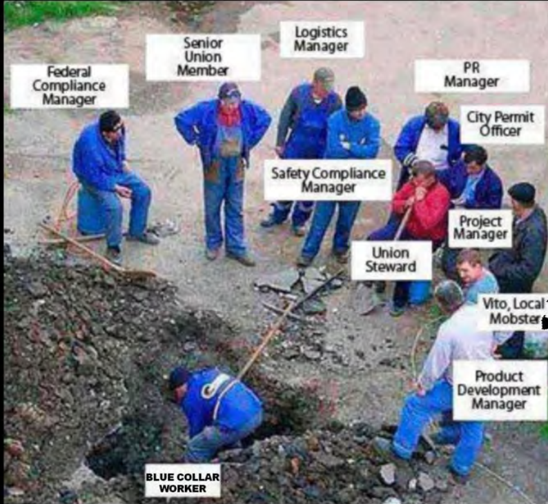
The Socialist Utopian Jobs Creation Agenda